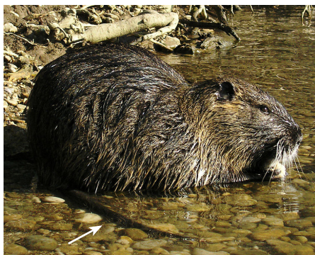
The nutria is distinguishable from the beaver and the muskrat by its long rat-like tail.

https://www.fws.gov/chesapeakenutriaproject/