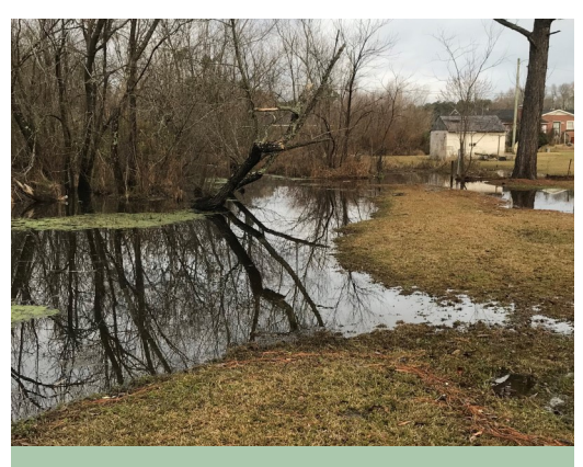
Beaver activity was causing flooding and threatening home septic systems in Lenoir County.