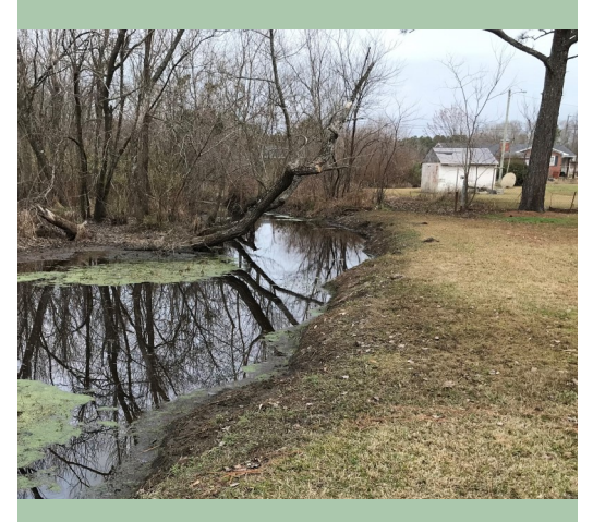
BMAP professionals removed the beavers and dams, resolving flooding issues and preventing damage to homes.