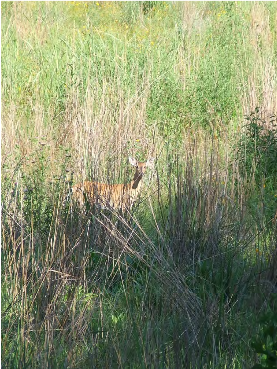
NWSG growth structure provides security for many species of wildlife ranging from Northern bobwhite quail to white-tailed deer.